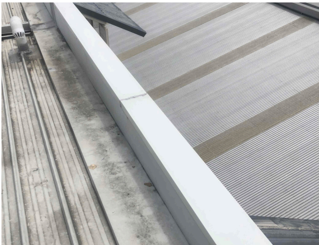
New flashing installed by our Roofing Team